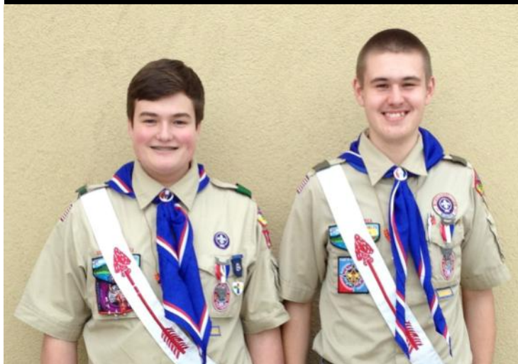
2013 Cook Team Co-Chairs