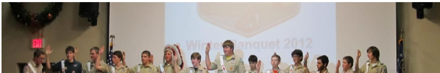
Lodge and Chapter Officers being sworn in at Banquet 2012