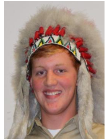
2013 Lodge Chief

The year has come, 2013! Time to portray our service and pride! This year we are looking forward to several great things. To start our year off we hosted our annual Klondike Derby with the theme "The Delaware Trail" and it was quite a success. Continued on Page 5.